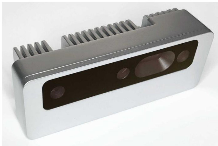
Figure 1 – OAK-D Pro PoE